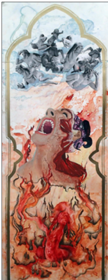
Divining Milton: Satan Gives Birth to Sin Paradise Lost II: 635–808 Collage, ink, acrylic, charcoal, and watercolor on Yupo 50 x 18 in.

Sin’s birth is rooted in the ancient myth of Athena’s genesis. Just as Athena was born out of Zeus’s head, so Sin is begotten from the head of Satan. Eve says to Satan, “All of a sudden, miserable pain surprised thee, dim thine eyes, and dizzy swum in darkness, while thy head flames thick and fast threw forth, till on the left side opening wide, likest to thee in shape and countenance bright, then shining heavenly fair, a goddess armed out of thy head I sprung?” (2.751–56)