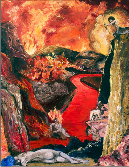
The Violent in the Plain of Fire (7th Circle). Oil on canvas, 26 x 20 in.