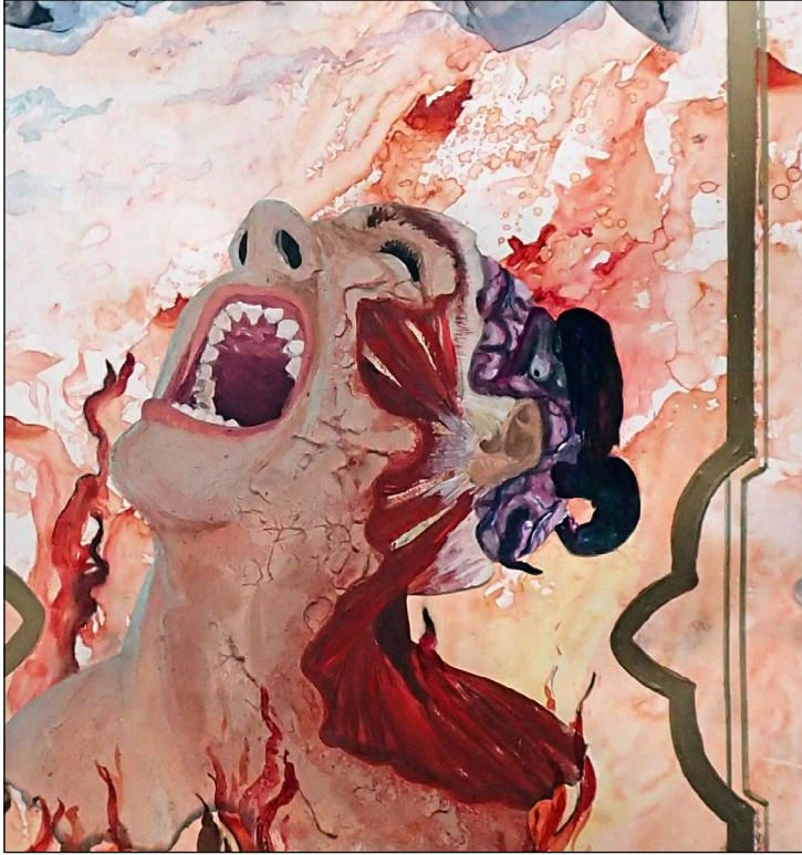
Detail: Satan Gives Birth to Sin

Certain themes and words jump off the page in that passage. Milton's tone is one of horror and repulsion, so I imagine Sin's emergence from Satan's mind to be horrific, sickening, and gruesome as well. The flames literally eat through his false exterior, revealing the true soul within and creating a portal through which Sin aggressively "springs" forth. She splits "[open] wide" the left side of his skull and claws her way out (2.755). Sin is described by Milton as a "snaky sorceress" (2.724), seeming like a "woman to the waist and fair, but [ending] foul in many a scaly fold, voluminous and vast, a serpent armed with mortal sting" (2.650–52).