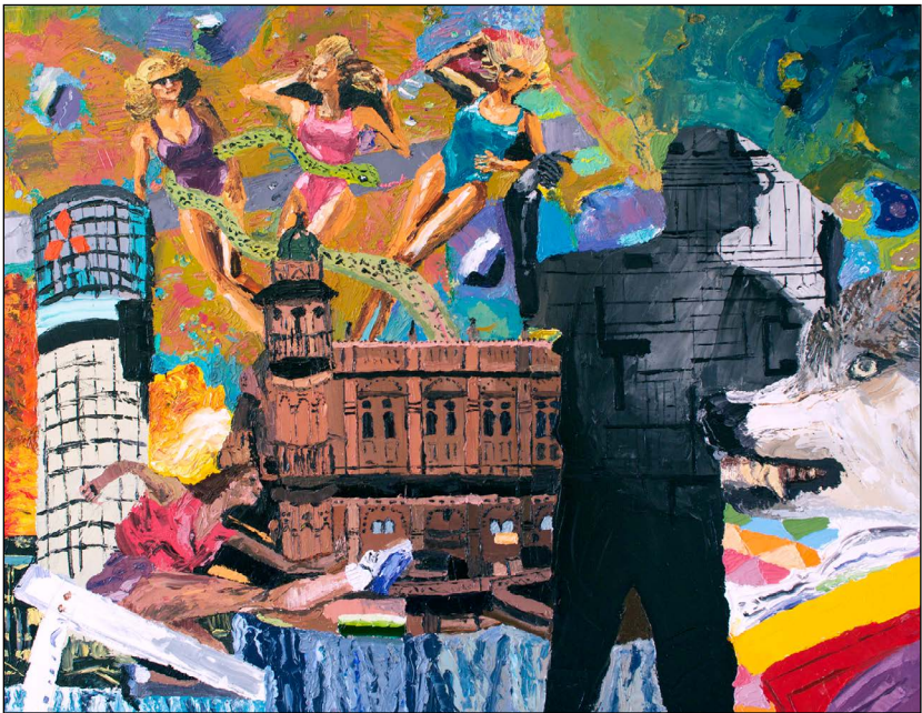
Traversing the City of Styx to the City of Dis: Dante and Virgil at the Gates of Hell Inferno, Canto IX. Oil on canvas, 20 x 26 in.