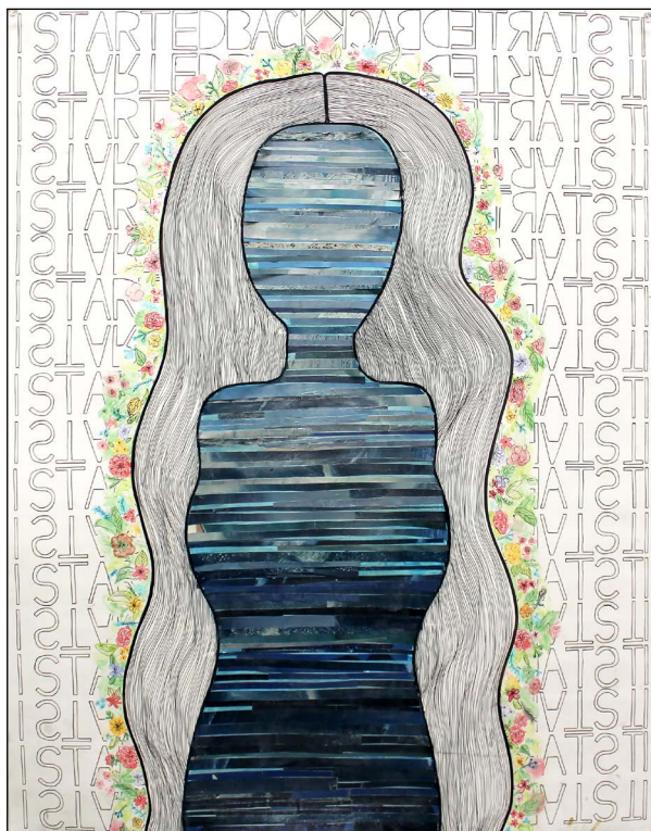
Eve Viewing Her Reflection in the Lake. Paradise Lost IV: 449–69

Collage, ink, and watercolor on Yupo, 40 x 33 in.